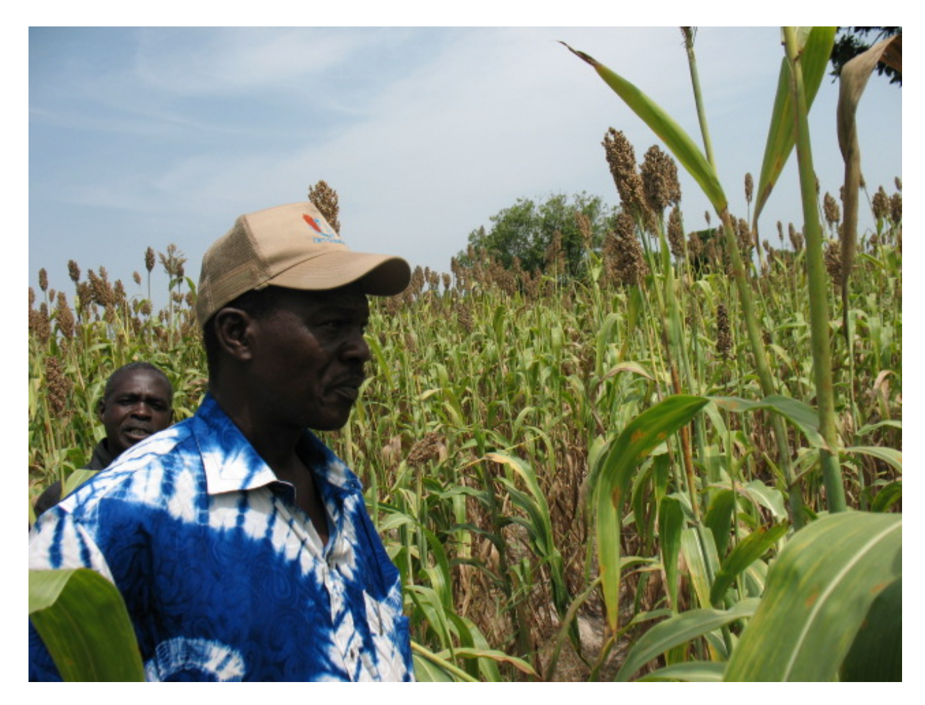
Picture 4. Soumba in Dioila, 2007.