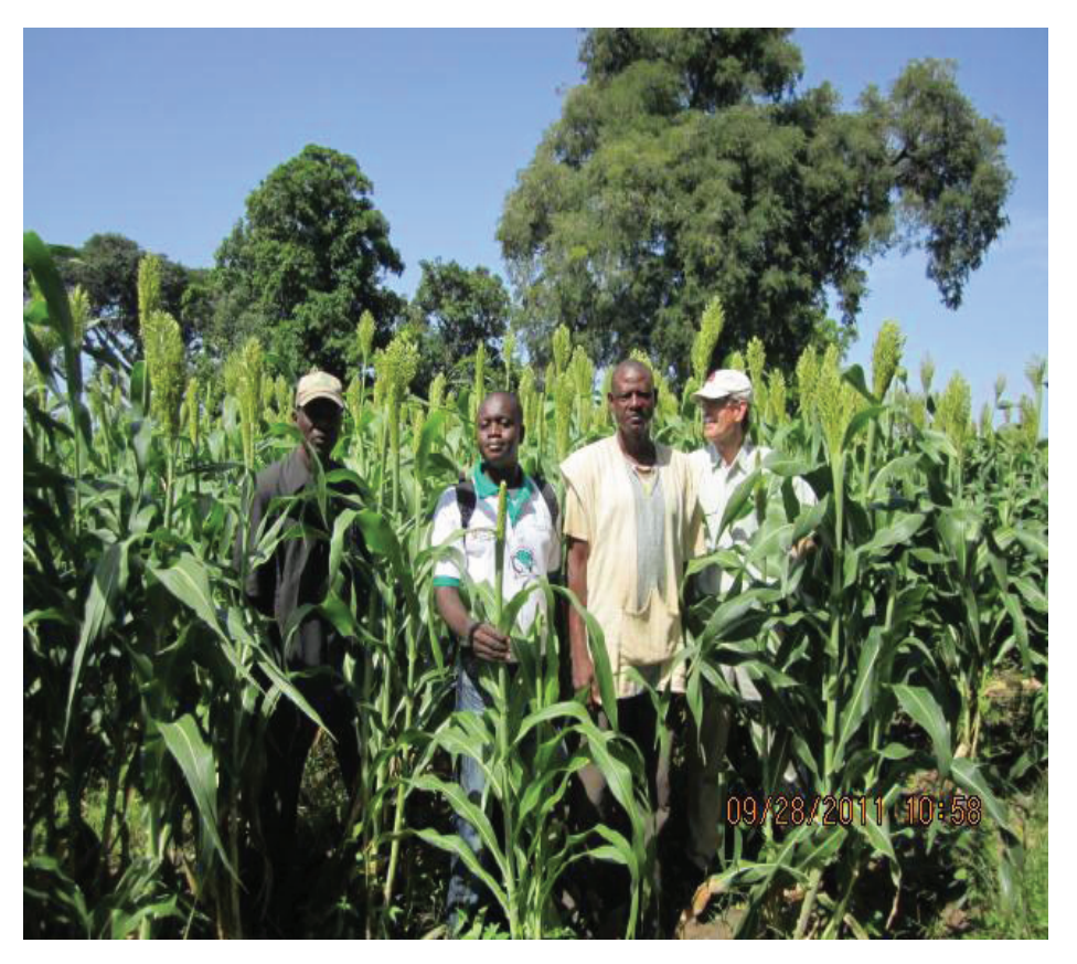
Koutiala region 2011: the project evaluation team in a Grinkan field.

In terms of the project's perspective, with the scaling up of the areas cultivated for the improved varieties, it is essential to continue to expand demand for millet and sorghum through the development of new markets including food processing industry and the intensive poultry industry.