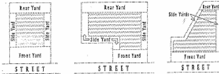
INTERIOR LOT EXAMPLES