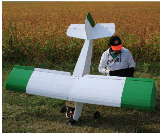
Unmanned aerial vehicle