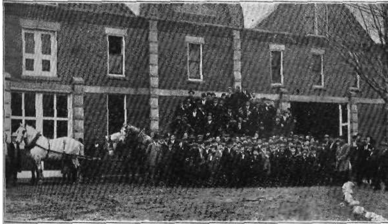
Fig. 46. County corn club boys inspecting and judging horses at the LaFayette Stock Farm

demonstrations of methods of teaching agriculture. This work has been appreciated and has done much to forward the teaching of agriculture in the schools. During the coming year, special attention will be given by this department to teachers who wish to do some agricultural work.