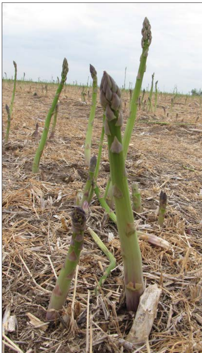
Harvest asparagus spears in the morning for best quality.

Clethodim products at 0.068-0.125 lb. a.i. per acre. Use formulations with 0.97 lb. a.i. per gallon at 9-16 fl. oz. per acre. Use formulations with 2 lb. a.i. per gallon at 6-8 fl. oz. per acre. Use 1 qt. COC per 25 gallons