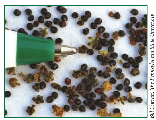
Figure 4. Common lambsquarter seeds are smooth and shiny. About 3% are brown, which germinate readily. The remainder are black, which are more dormant.

Removing the papery covering reveals smooth, shiny seeds (Figure 4). About 3% of the seeds are brown; the remainder are black (Williams and Harper, 1965). Brown seeds germinate readily, while black seeds are more dormant. Many