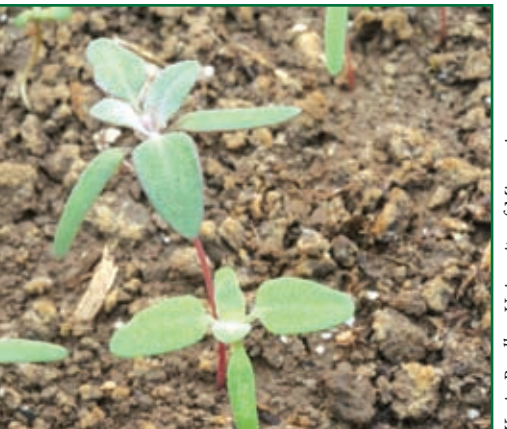
Figure 1. The first ovate-shaped true leaves of common lambsquarters appear opposite in arrangement.

The stems can be green or reddish, are grooved, and can be smooth or hairless. Mature plants generally reach a height of 2 to 6 feet. At flowering, very small, green or gray-green flowers are tightly clustered at the tips of stems and branches (Figure 3). These flowers turn into seeds with a thin, papery covering. An average