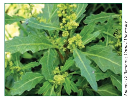
Figure 5. Oakleaf goosefoot is often confused with common lambsquarters, but mature oakleaf goosefoot leaves are generally oval and have wavytoothed margins, often with a prominent yellowish green line down the center of the upper leaves.

Seed dormancy in common lambsquarters contributes to its success as a weed. Under certain conditions it can remain viable in the soil for several decades. In fact, viable seeds have been recovered from medieval ruins in Europe (Mohler and DiTommaso). Most seeds require some time before they are ready to germinate. Light, strong day and night temperature fluctuations, and the presence of nitrate in the soil increase