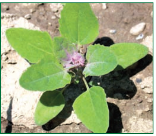
Figure 2. Eventually, common lambsquarters leaves become more distinctly alternate and may be purplish. Note the characteristicly white, granular substance on the leaves of this plant.