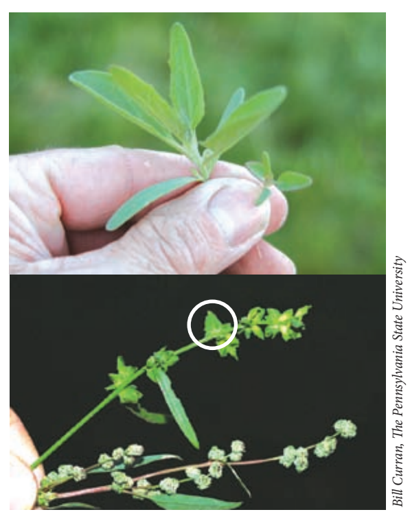
Figure 6. (Top photo) Spreading orach (left) is similar in appearance to common lambsquarters (right), but Atriplex species have 2 to 6 pairs of opposite leaves and branches. (Bottom photo) Spreading orach (top) and other Atriplex species also have a diamond-shaped bract surrounding each flower (circled), unlike common lambsquarters (bottom).

is by far the most abundant weedy member of the goosefoot family. A number of C. album subspecies, varieties, and forms have been recognized over the years, but most are believed to be minor variants of the species (Abrams, 1944). Information on the herbicide susceptibility of goosefoot members other than common lambsquarters is lacking.