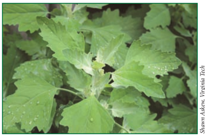
Figure 8. Common lambsquarters can emerge so early that it may be present at planting. Control at this time is crucial.

Common lambsquarters can emerge early enough in the spring to be present at the time of no-till corn and soybean planting. Effective control of emerged plants at this time is essential for effective in-season management. Depending on plant size and environmental conditions, glyphosate provides variable control, as does paraquat (Gramoxone®). Adding 2,4-D ester to burndown treatments can help ensure effective control. In corn, adding atrazine, mesotrione (Camix<sup>®</sup>, Lumax<sup>®</sup>, Lexar<sup>®</sup>), or dicamba (Clarity<sup>®</sup>) can also improve control of emerged plants.