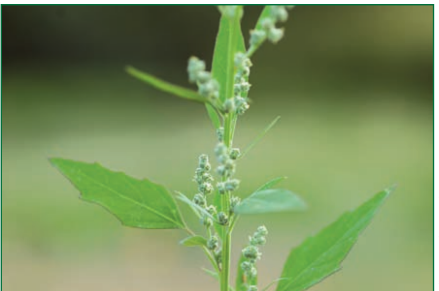
Figure 3. Common lambsquarter flowers are green and tightly clustered at the tips of stems and branches.