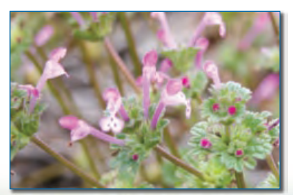
Henbit at flowering