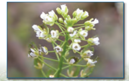
Field pennycress at flowering