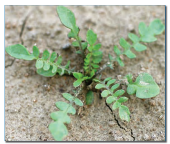
A small-flowered bittercress rosette