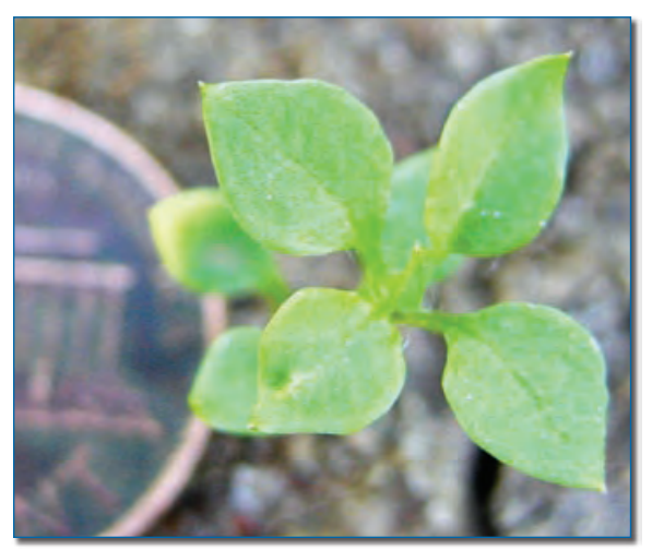
A common chickweed seedling