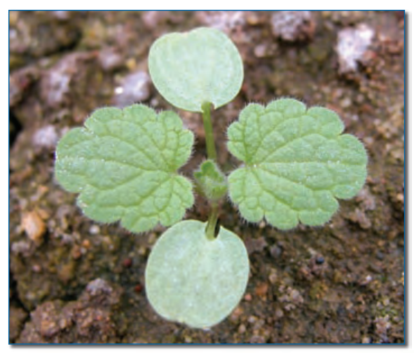
Purple deadnettle seedling with the cotyledon and first true leaves fully exposed