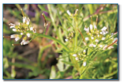
Small-flowered bittercress at flowering