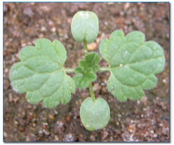
Henbit seedling with the cotyledon and first true leaves fully exposed