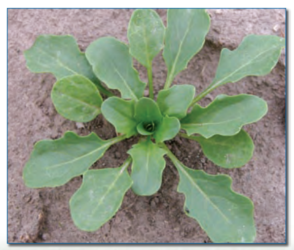
A field pennycress rosette