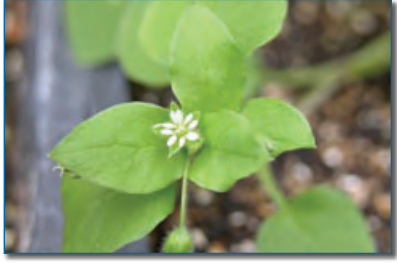
Common chickweed at flowering