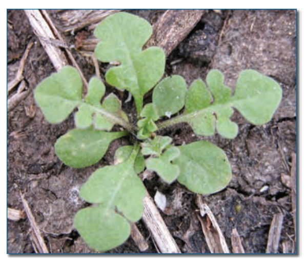
A shepherd's-purse rosette