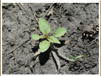
Smooth pigweed seedling