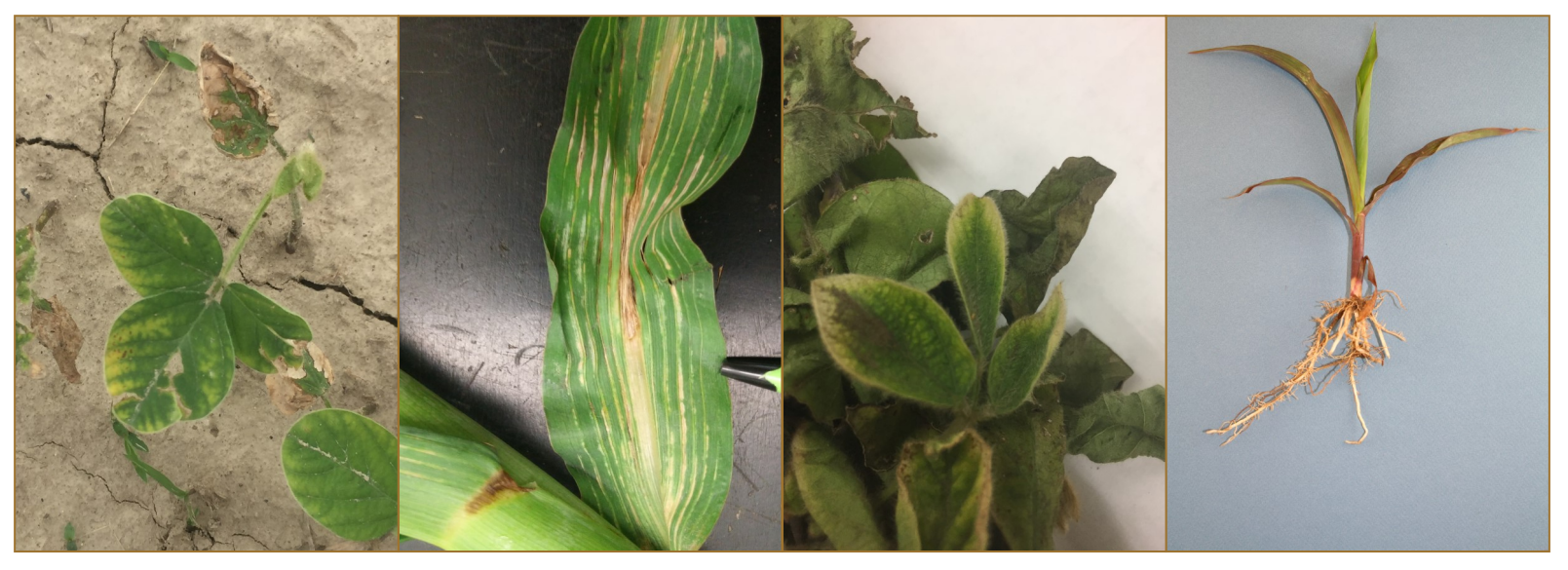
Figure 3. Atrazine carryover onto soybean. Marginal necrosis and chlorosis appears on older leaves. Newer leaves eventually emerge with little to no symptoms.

The third issue to consider is soil pH. As stated above, extremes in soil pH can cause some herbicides to be more persistent. A target soil pH of about 6.5-7.0 will reduce carryover potential of most of the herbicides we use in Indiana corn and soybean. If you know of isolated areas in a field with pH extremes, we now have the technology to map these areas out and apply corrective measures to smaller areas of a field.