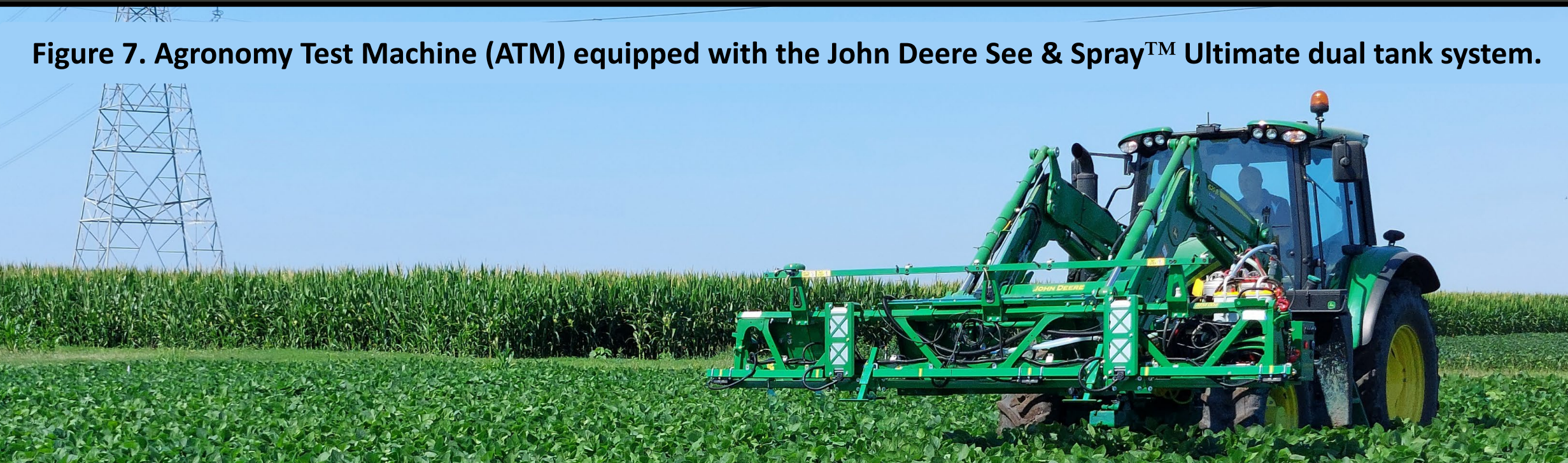
Figure 7. Agronomy Test Machine (ATM) equipped with the John Deere See & Spray™ Ultimate dual tank system.

Evaluate the effect of splitting clethodim from dicamba + glyphosate by using a dual tank delivery system in comparison to single tank mixtures on the control of glyphosate-resistant volunteer corn.