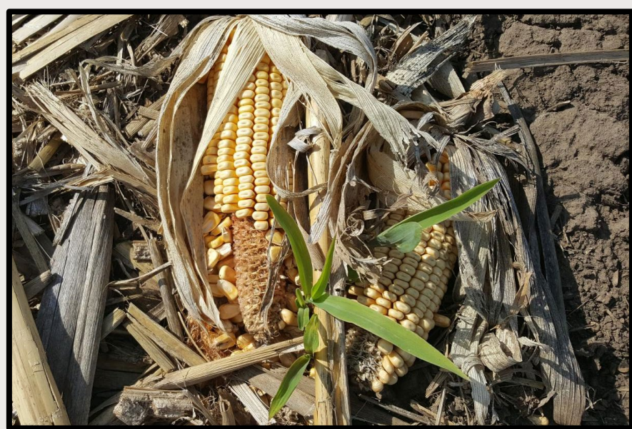
Figure 1. Volunteer corn sprouting from corn ears.