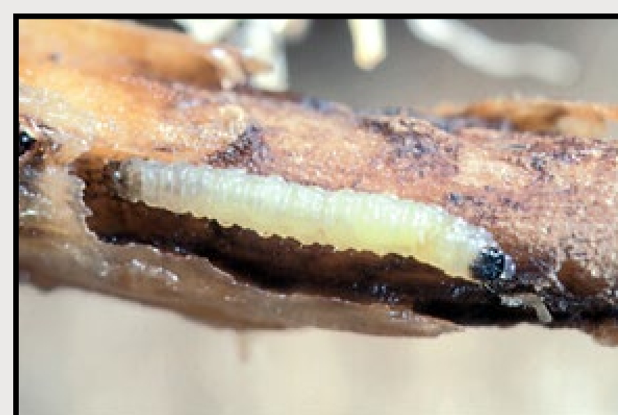
Figure 4. Western Corn Rootworm larva.