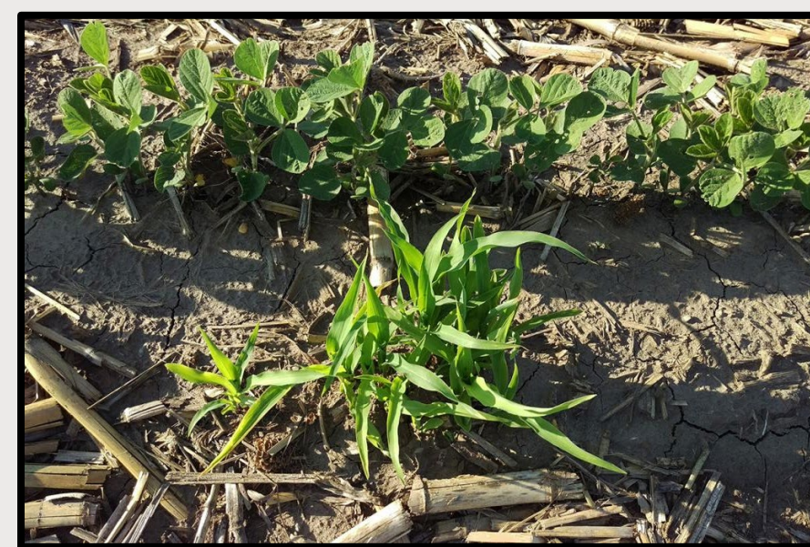
Figure 2. Volunteer corn clumps.