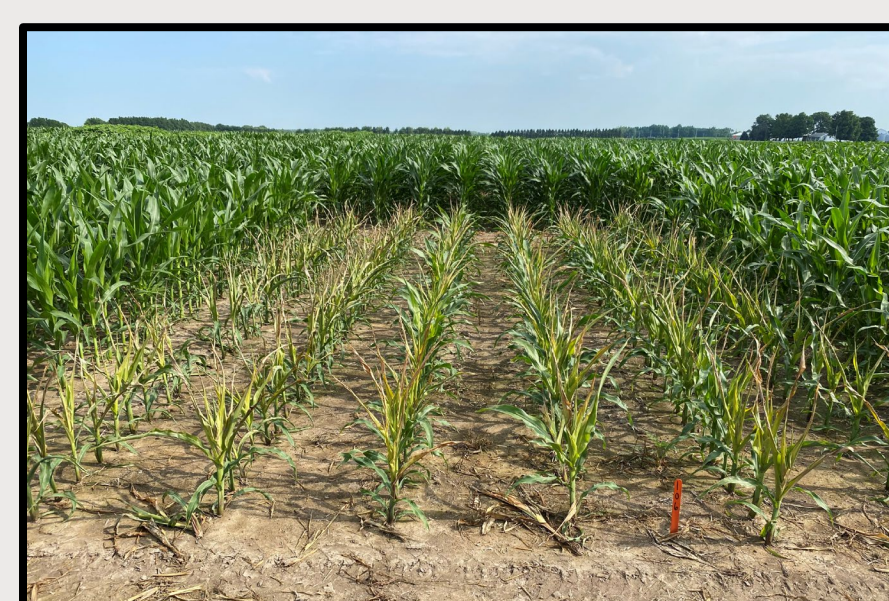
Figure 6. Plants stop growing within hours of application and newer leaves die first.