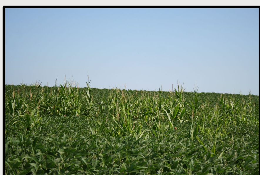
Figure 3. Volunteer corn competition in a soybean field.