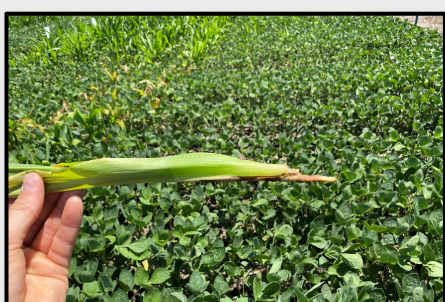
Figure 5. Necrosis of corn growing point at the whorl following application of ACCCase-inhibiting herbicides.