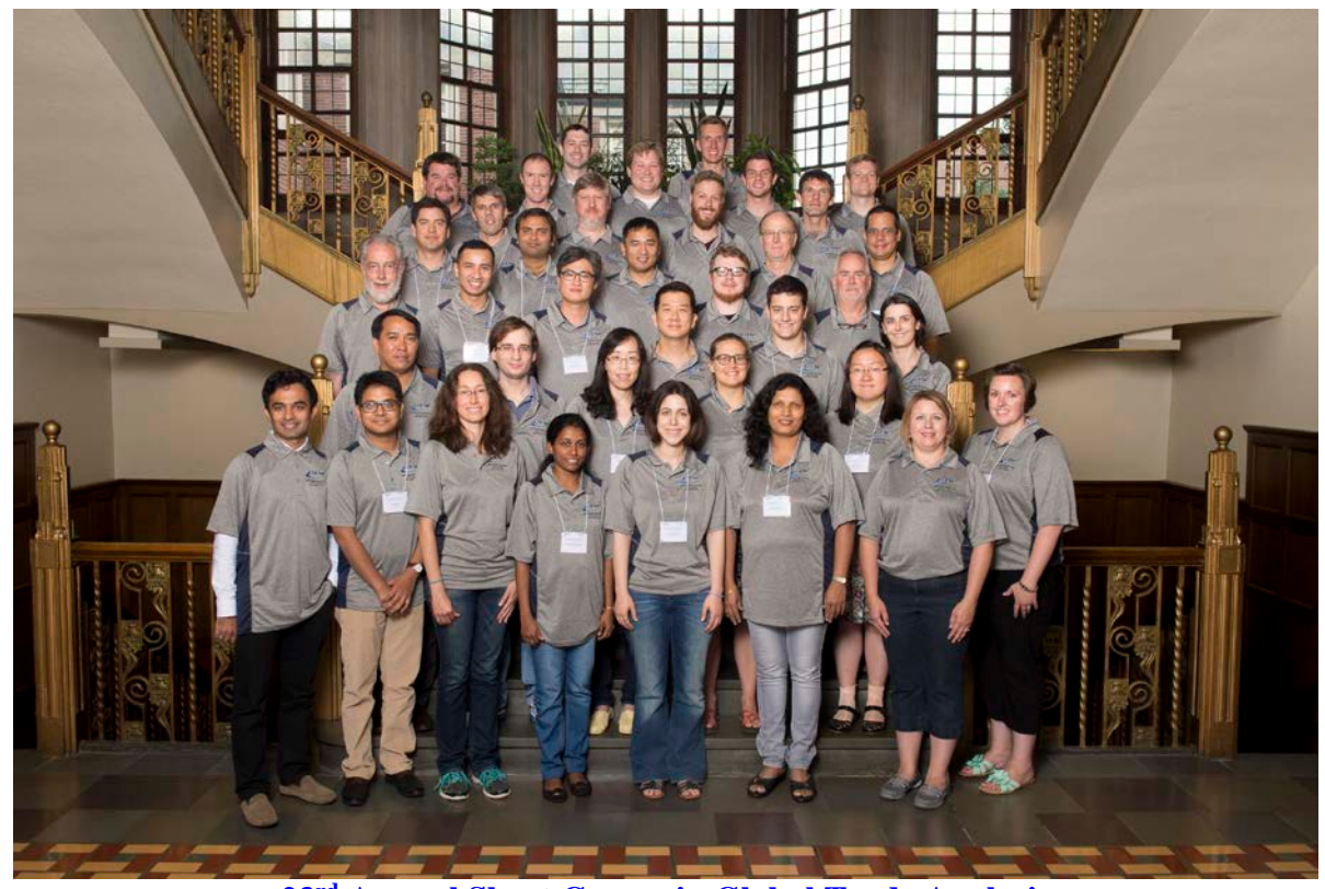
23<sup>rd</sup> Annual Short Course in Global Trade Analysis "Introduction to Applied General Equilibrium Analysis in a Multi-Region Framework"

The <u>Center for Global Trade Analysis</u>, in the <u>Department of Agricultural Economics</u>, recently held the <u>23<sup>rd</sup> Annual Short Course in Global Economic Analysis from July 11-17, 2015 on the campus of Purdue University.</u>