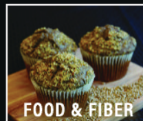
FOOD & FIBER