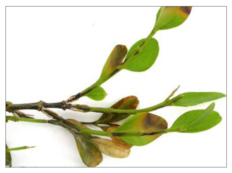
Figure 4. The black streaks on these stems are typical of boxwood blight.

The best way to manage boxwood blight is to avoid introducing the disease into the nursery or landscape.