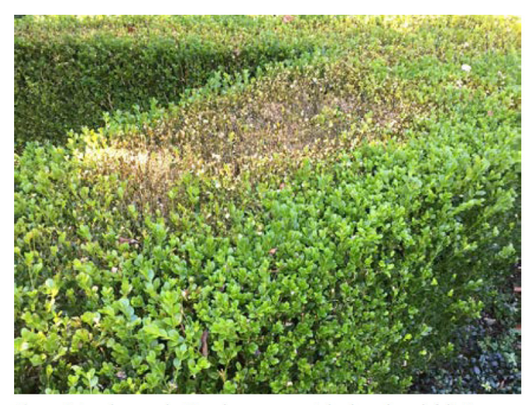
Figure 6. Landscape plantings lose ornamental value when defoliation from boxwood blight becomes severe.