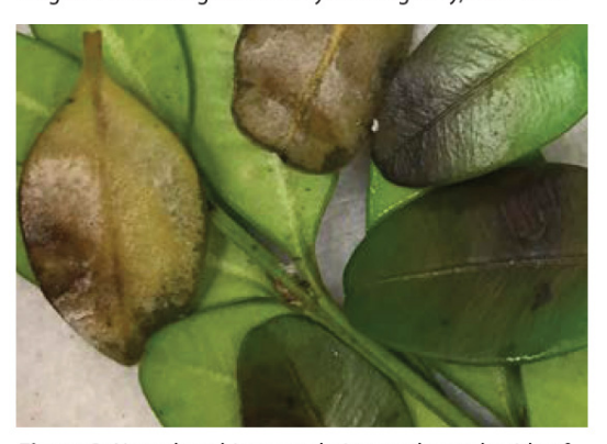
Figure 2. Note the white sporulation on the underside of infected leaves. The fungus that causes boxwood blight sporulates following high humidity.