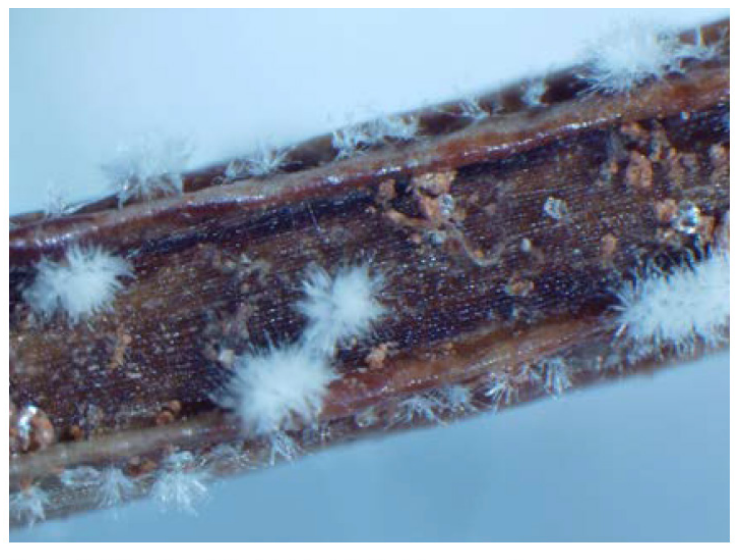
Figure 5. When humidity is high, infected stems produce numerous spores.