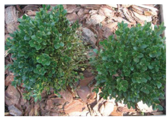
Figure 3. The boxwood plant on the left shows defoliation from boxwood blight that starts from the bottom and moves up. The neighboring plant exhibits spots on its lower leaves; however, it does not yet show any symptoms of defoliation.