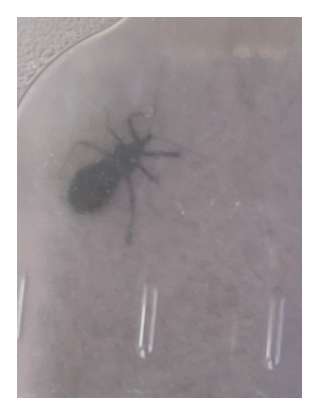
Have a way to measure but out of focus.