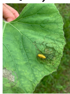
Too far away.