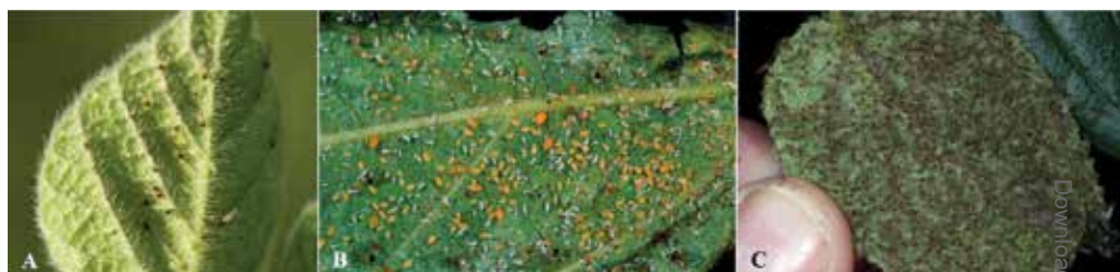
Fig. 4. Leaves with heavy infestation of soybean aphids ( Aphis glycines). (A) Winged adults on soybean, Glycine max. (B) Mostly apterous viviparae adults on soybeans. (C) Dense soybean aphid congregation on the winter host, buckthorn ( Rhamnus cathartica).