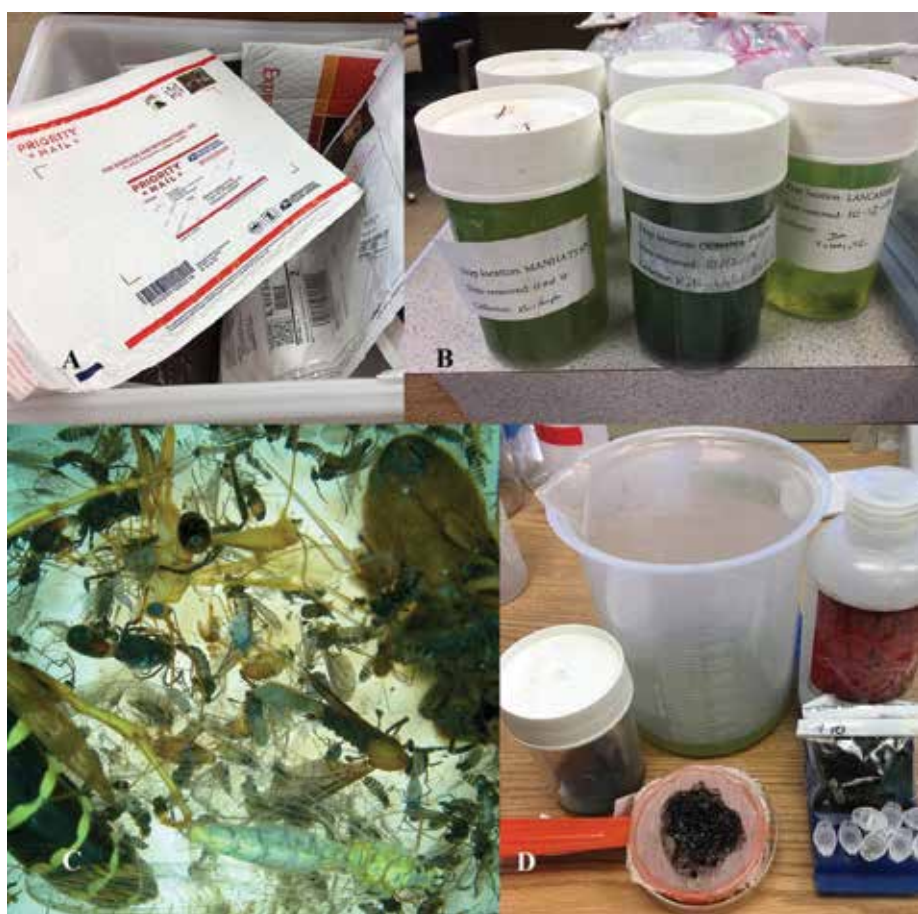
Fig. 3. Suction-trap sample supplies. (A) Padded mailing envelopes. (B) Jars with liquid collection. (C) Suction-trap sample under dissecting microscope. (D) Suction-trap samples processed and stored into Whirl-paks.

Research efforts to understand the biology and management of the soybean aphid began in earnest across the Midwest in 2001. In Illinois, research support from