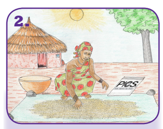
Make sure the grain you are storing is dry and clean (has no debris)