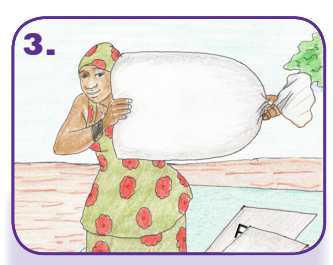
Check the two inner liners for holes or tears (don't use defective liners)