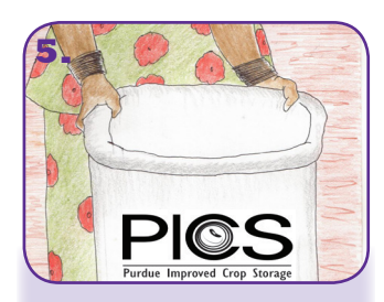
Insert the two liners into the woven bag. Fold over the tops of all three bags together