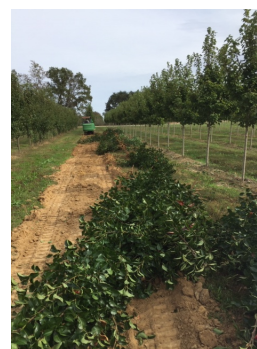
Upper Left: Callery pear invasion. Right: Voluntary Callery pear removal by an Indiana nursery. Lower left: Native alternative: downy serviceberry.

All of the approximately 20 different cultivars and varieties of Callery pear are invasive, including "Bradford pear," "Aristocrat," "Autumn Blaze," "Redspire," and "Whitehouse." Callery pear has become one of Indiana's greatest invasive species headaches, spreading through thousands of acres of natural and managed lands at substantial economic and ecological cost to people and wildlife.