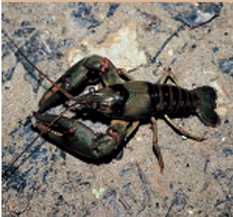
Tom R. Johnson

Hellbenders need cool, clear, unpolluted waterways with large rocks and riffles to live, such as the Big Piney River (far left) and the Jacks Fork River (bottom). In such waterways hellbenders seek both shelter and their main food source crayfish (below).