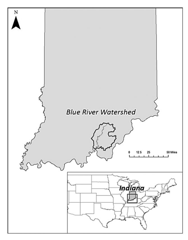
Figure 1 The Blue River watershed and its location in Indiana, USA.

In the summer of 2011, we conducted a survey of heads of households and riparian landowners in the Blue River watershed of southern Indiana (Fig. 1). Two methods were