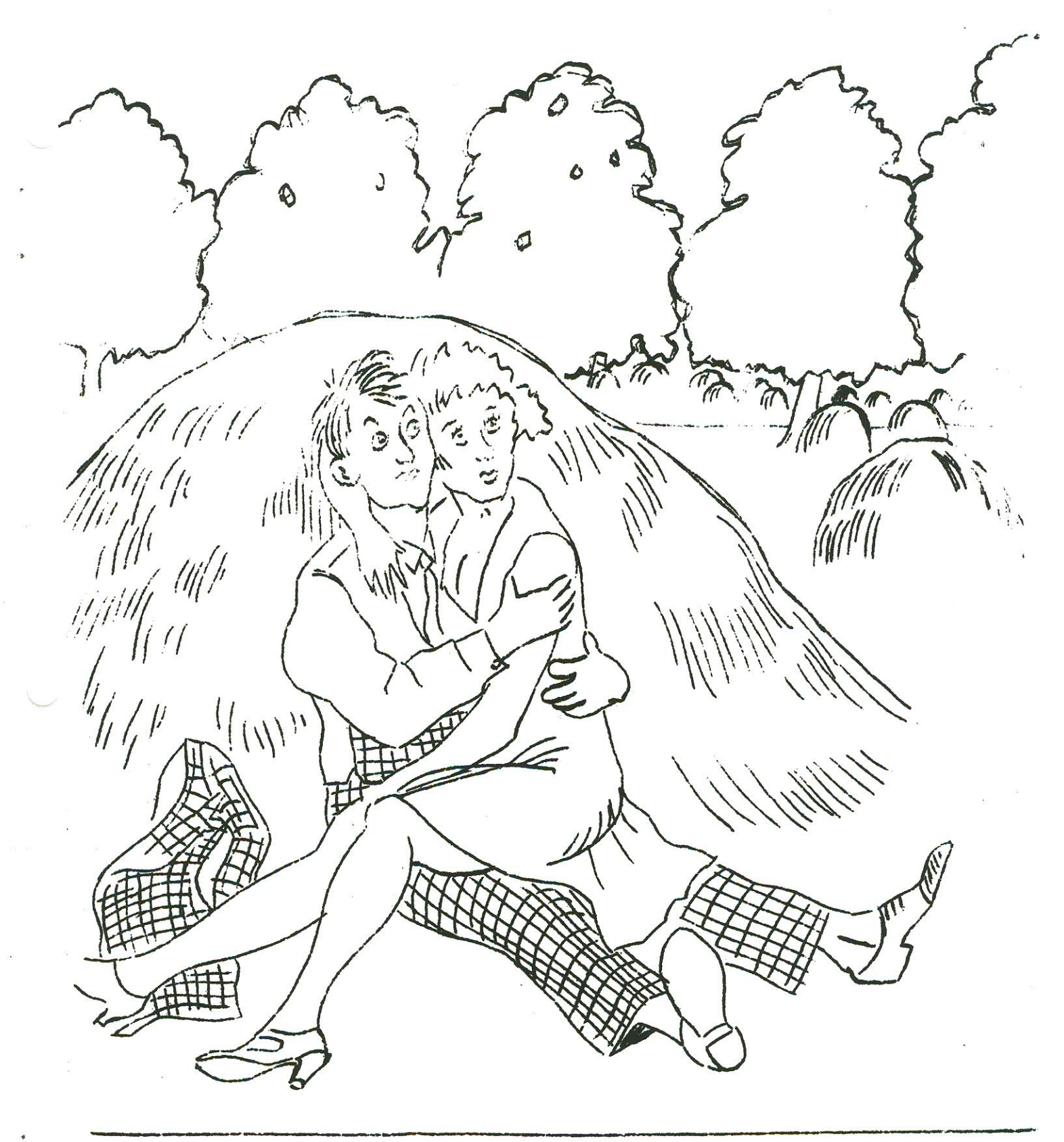
Blank-The Cruiser - On Off Hours He Studies Timbers