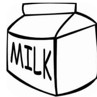
NCIMS Dairy HACCP