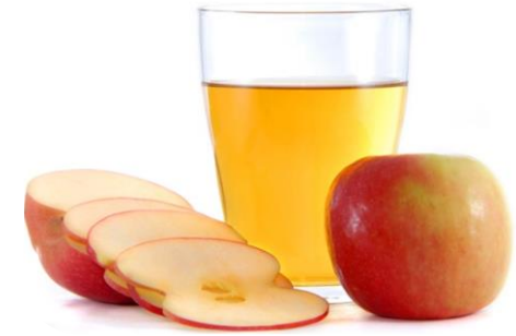
FDA Juice HACCP regs