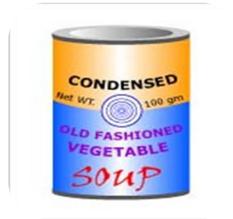
Low-acid canned food regs