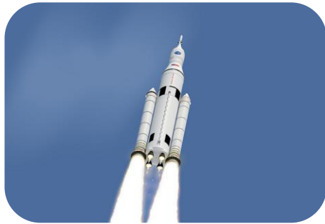
US Space program