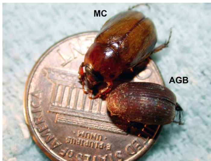
Figure 2. Adult masked chafer (MC, top) versus Asiatic garden beetle (AGB, bottom) on a penny.

Adult beetles are drab, brown beetles that are 0.35 inches long, roughly the size of a coffee bean. These beetles are in the scarab family, and there are similar-looking beetles that might be confused with Asiatic garden beetles (see E-271, Managing white grubs in turfgrass ). Adult AGBs fly at night