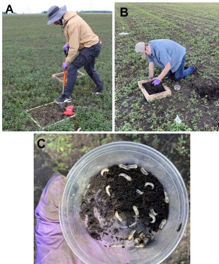
Figure 7A-C. Soil sampling for Asiatic garden beetle larvae using a shovel, a 0.25 m 2 (2.7 ft 2 ) PVC frame (A), and a soil sieve (B) to detect second and third instar larvae (C).

Simple tools that can make sampling easy and consistent among mint fields include a 0.25 m 2 (2.7 ft 2 ) frame, made of PVC or other material, a shovel, a plastic dishpan or bucket, and a soil sieve with a screen size of 0.125-inches, which is big enough to allow soil to pass through, but small enough to catch second and third instar AGB larvae (Figure 7).