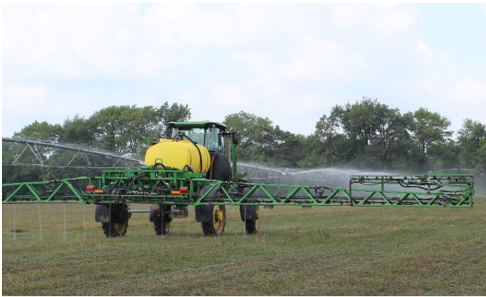
Figure 9. Application of insect-parasitic nematodes to the soil of a post-harvest peppermint field using a tractor boom.

Alternatively, biological control agents like insect-parasitic nematodes (IPNs, also referred to as entomopathogenic nematodes) are known to suppress soil-dwelling insects, including AGB larvae. Insect-parasitic nematodes are microscopic roundworms that occur naturally in the soil and only attack insects. There are many different species of IPNs with unique hunting behaviors, but all IPNs attack insects by entering the body through natural openings and releasing symbiotic bacteria that eventually kill and digest the insect (Figure 8). Research with IPNs in a number of cropping systems, including mint, have shown efficacy against AGB larvae; however, most current research indicates that repeated applications of IPNs may be required to maintain population densities that are high enough to suppress AGB larval infestations. Moreover,