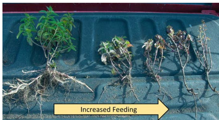
Figure 5. Mint plants with symptoms of root injury caused by Asiatic garden beetle (AGB) larvae. Healthy mint plants have dense, fibrous roots (left), while roots fed on by AGB larvae have little to no fine roots hairs remaining.

AGB larvae are the damaging life stage of this pest in peppermint and spearmint production; there is no evidence that adults feed on or damage mint foliage. The larvae feed on the fine root hairs (tertiary roots) of mint plants, and when infestations are severe, the tertiary and secondary root hairs may be completely removed by feeding so that only primary root structures remain (Figure 5). Mint plants suffering from damage by AGB larvae may appear wilted, stunted, or with purpling leaves, especially when infestations are severe. Importantly, these symptoms of stress are not unique to AGB larval feeding, so it is always necessary to inspect the soil and plant roots to confirm the presence of AGB prior to taking remedial action (Figure 5).