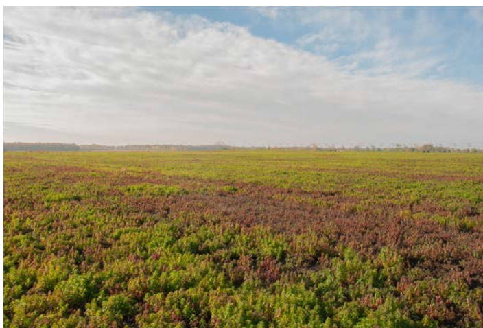
Figure 1. Symptoms of damage by Asiatic garden beetle larvae in a spearmint field.

when temperatures are 65-70 °F. They are attracted to lights and may be captured in light traps. Another common scarab beetle that might be mistaken for Asiatic garden beetle is the masked chafer; however, there are some key morphological differences between the two (Figure 2): 1) when viewed from above, the masked chafer's head is clearly visible, while the head of AGB appears hidden or obscured from view, 2) the masked chafer has dark coloration on the head between the eyes, giving the appearance of a black "mask", and 3) the masked chafer's body is slightly longer (0.45 inches).