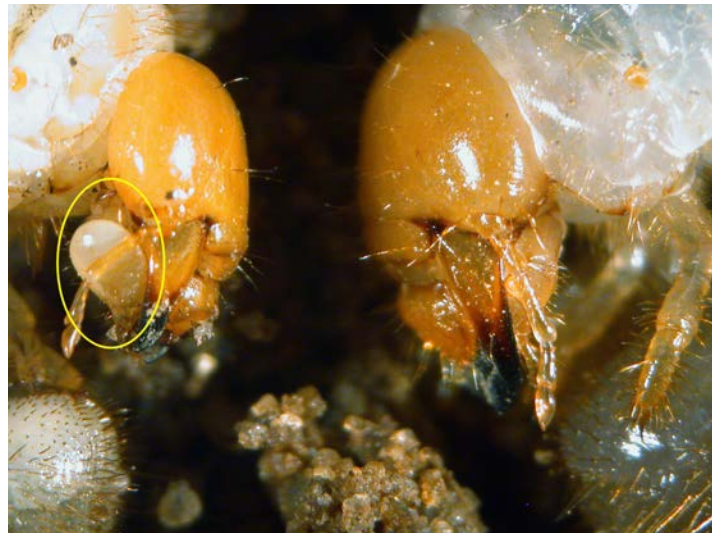
Figure 3. Mandibular stypes (yellow circle) are diagnostic features of Asiatic garden beetle larvae (left), and are not observed on other scarab larvae, like Japanese beetle larvae (right).

Adult beetles live for about 4 months, while the larval stage is much longer. AGB exist as larvae in the soil for ~10 months of the year, and during this time they progress through three developmental “stages”, known as “instars”. The three larval instars are progressively larger, and it is the third instar larva that survives the winter in the soil, burrowing deeper in response to cold temperatures in the fall. These larvae then move higher in the soil profile in response to warming soil temperatures in the spring (Figure 4).