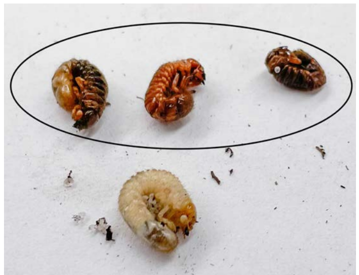
Figure 8. Asiatic garden beetle larvae that have been infected and killed by insect-parasitic nematodes (top) versus a healthy larva (bottom).

Biological control strategies. Biopesticides, which contain fungi and bacteria, are available and have shown efficacy against AGB larvae in turfgrass and vegetable systems; however, these products have either not been tested against AGB larvae in commercial mint fields, or are not labelled for use in commercial mint oil production systems.