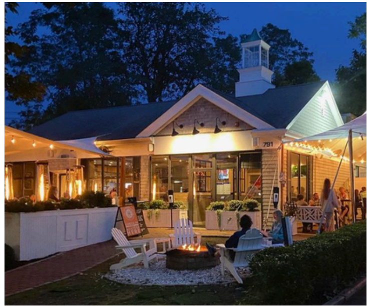
Crisp Flatbread Co.