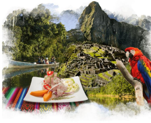
Peru 3 in 1: Gastronomy, Nature and Culture