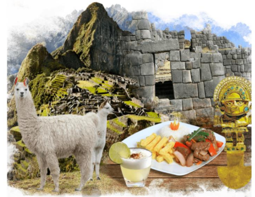
The Best of Peru