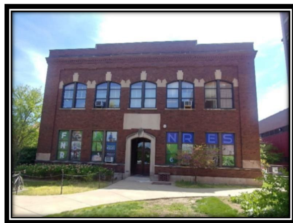
NRES located in the Forest Products Building (FPRD)