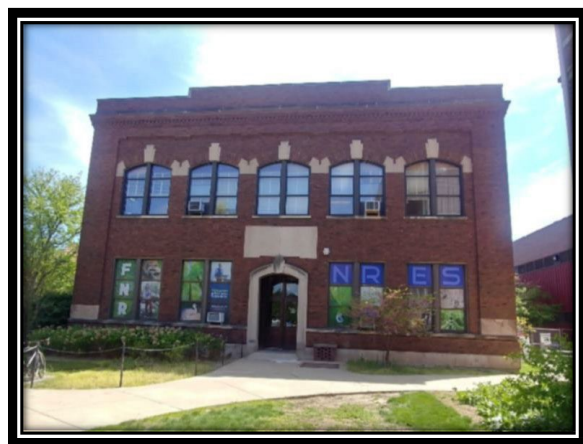
NRES located in the Forest Products Building (FPRD)