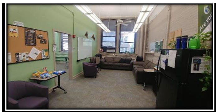
NRES Student Space