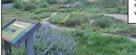
Native flower garden after ESC plug planting and maintenance workdays