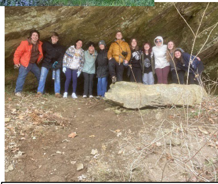
ESC winter hike at Portland Arch Nature Preserve- Fountain County, IN

If you are interested, have questions, or would like more information, email esc@purdue.edu