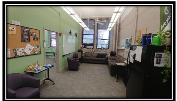
NRES Student Space