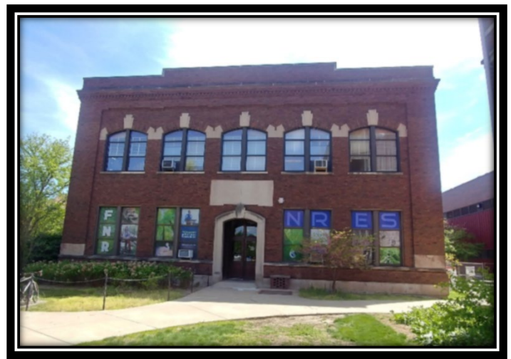
NRES is located in the Forest Products Building (FPRD)

Cora Chavez, Administrative Assistant chavez50@purdue.edu