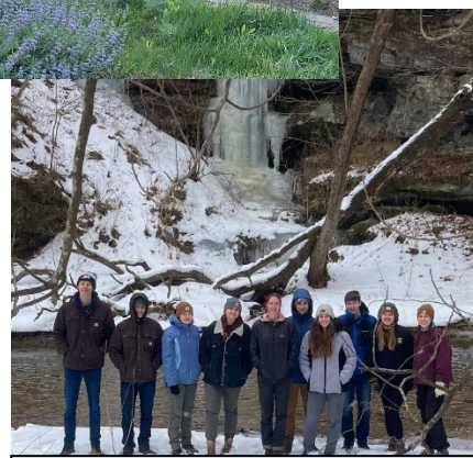
ESC winter hike at Portland Arch Nature Preserve- Fountain County, IN

If you are interested, have questions, or would like more information, email esc@purdue.edu