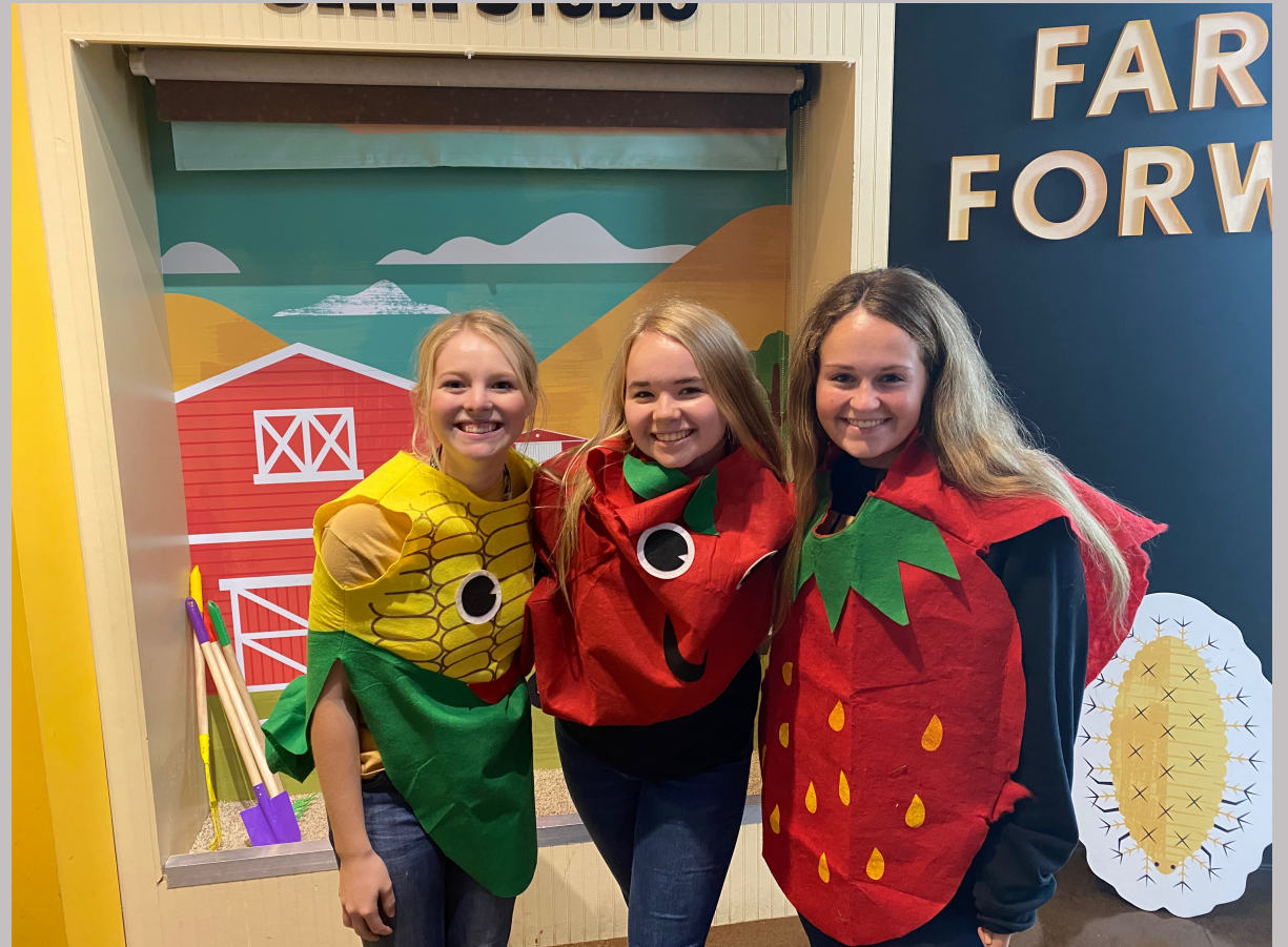
Fair Oaks Farms