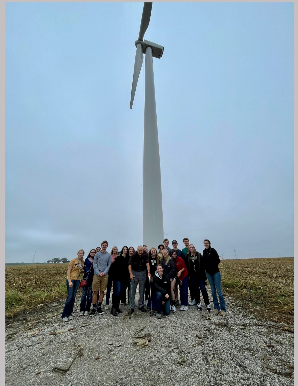
Benton County Wind Farm