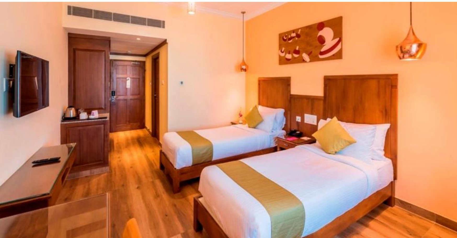
Hotel Regents Central, Mysore