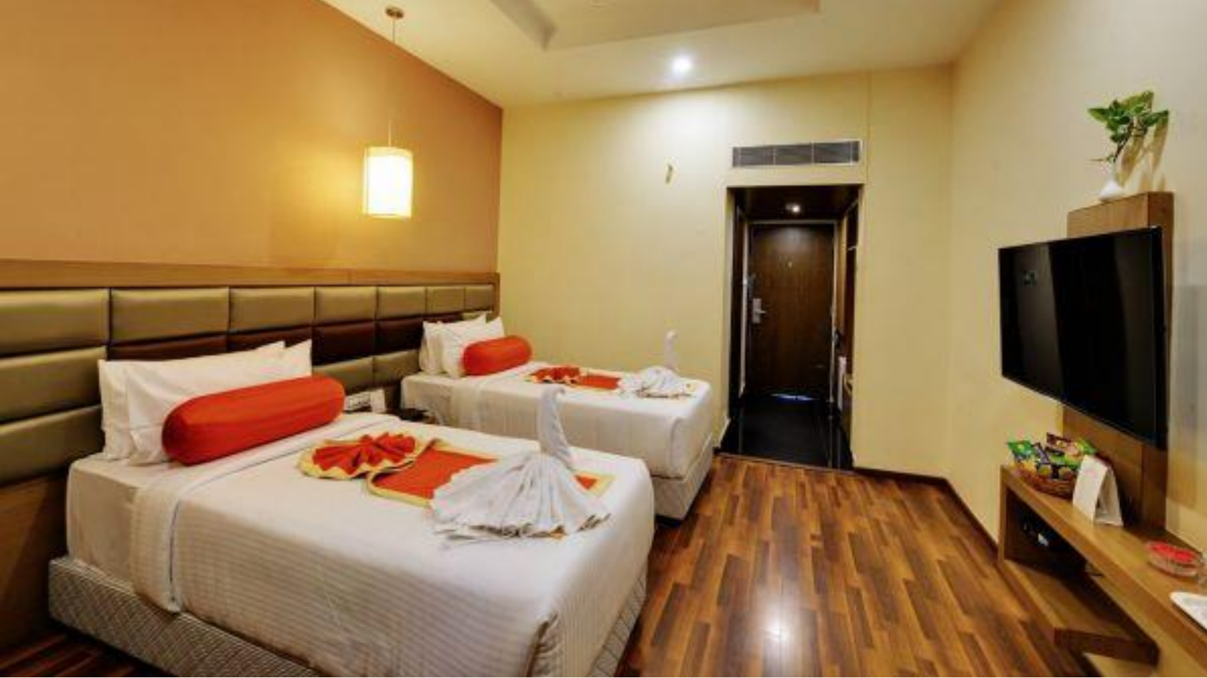
Rananashree Richmond Circle Hotel, Bangalore