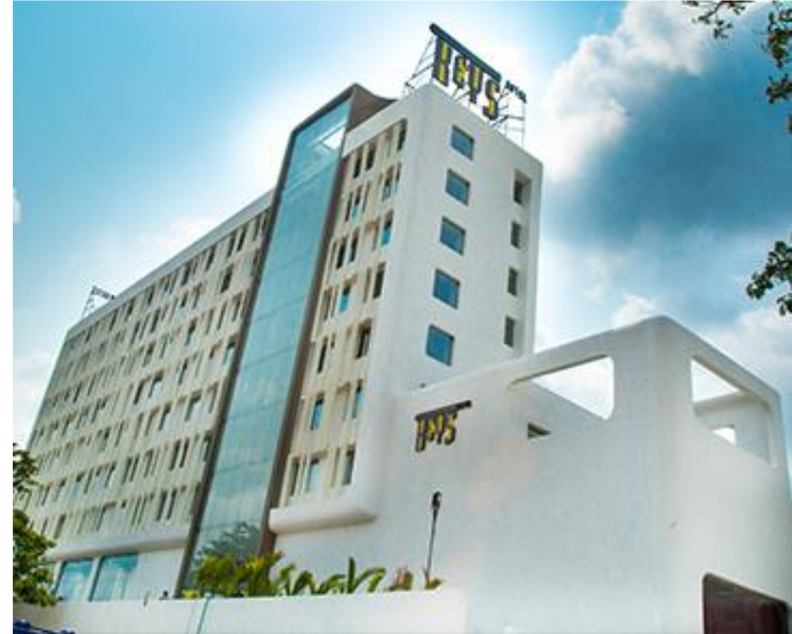
Keys Hotel, Kochi