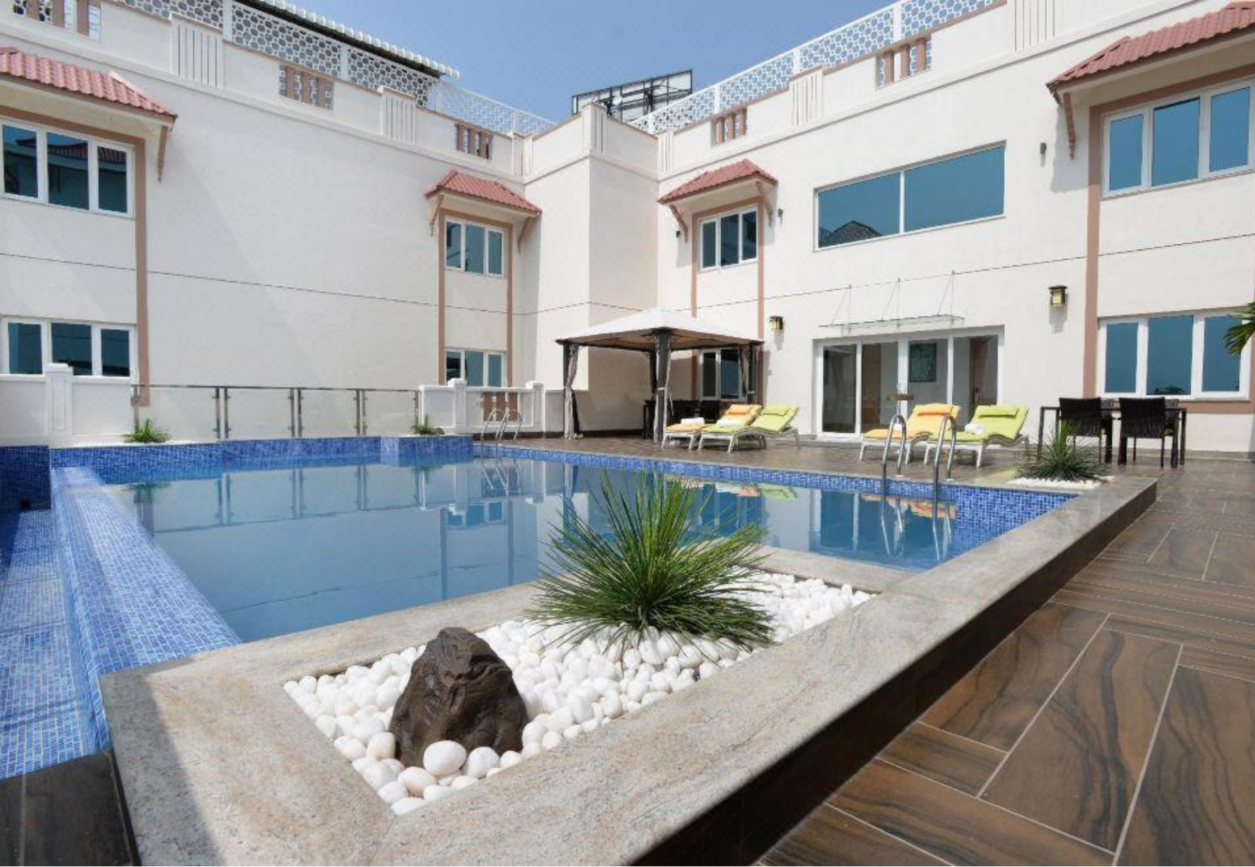
Lemon Tree Hotel, Coimbatore