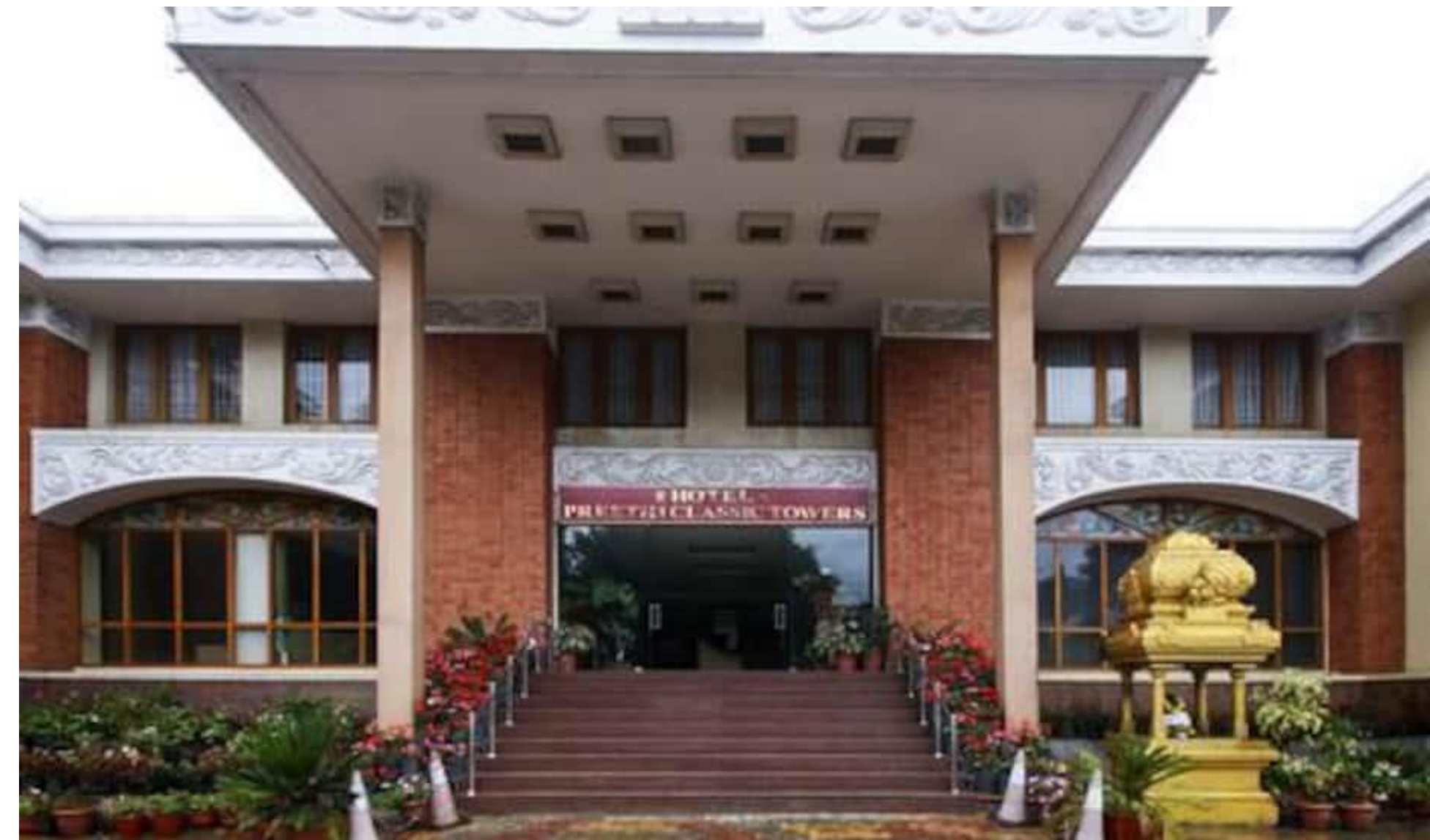
Preethi Classica Hotel, Ooty