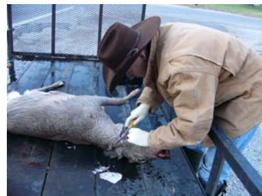
CWD sample collection in Indiana on opening day of the 2005 shotgun season.

The Newsletter will also consist of a set of reoccurring articles that will add continuity