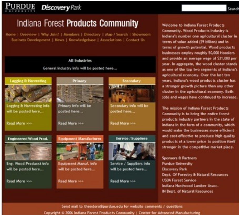
Figure 4. Home Page of Indiana Forest Products Web Community