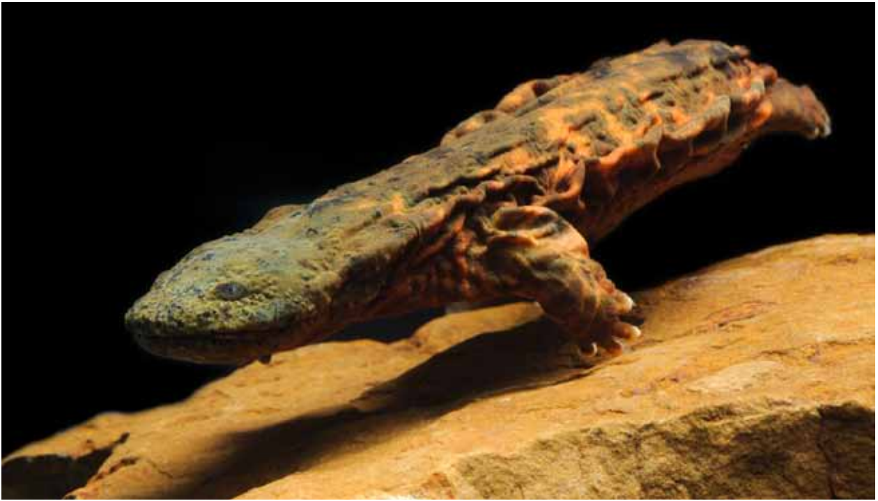
Figure 1. A North American giant salamander ( Cryptobranchus alleganiensis ) shows the characteristic morphology of the cryptobranchids; large robust dorso-ventrally flattened head and body, small eyes, thick legs with stubby digits, lateral folds of skin for respiration, and sensory papillae for detecting water movement and prey (laterally flattened tail not shown).

the suite of articles as it has progressed over many years, we have included all authors on all articles. The major contributing authors to “The giant salamanders (Cryptobranchidae): Part A. palaeontology, phylogeny, genetics, and morphology” are Amy McMillan and Paul Hime (genetics), Raul Diaz (palaeontology, genetics), and Paul Hime (phylogeny).