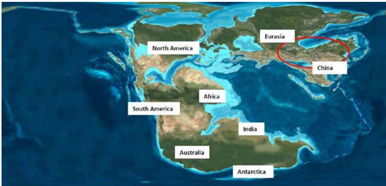
Figure 2. Fossil salamanders strongly support an east Asian (red ellipse) origin for the Cryptobranchoidea. The continents were distributed very differently in the Mid-Jurassic (170 MYA) before continental drift moved them to their present locations. However, Eurasia and North America remained in the Northern Hemisphere. By the Late Pliocene (3 MYA) the continents had moved to their present positions. Adapted from Gao and Shubin, 2003.

chidae): Part C. etymology, cultural significance, conservation status, threats, sustainable management, reproduction technologies, aquaculture and conservation breeding programs, and rehabilitation and supplementation.”