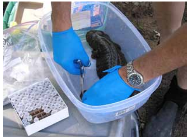
Figure 5 a, b. Taking tissue samples from tail clips or blood samples enables conservation geneticists to assess an individual's relationship to other individual cryptobranchids and the relationship of its population to other populations of the same species.