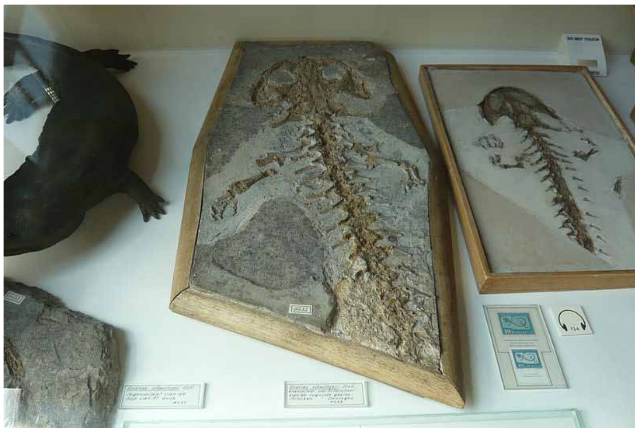
Figure 3. The Late Oligocene to Early Pliocene (23.0 to 5.3 MYA) species A. scheuchzeri was distributed from Central Europe to the Zaissan Basin on the border of Kazakhstan and China. Fossil room II, Teylers Museum, The Netherlands Andrias scheuchzeri Oeningen.

with subsequent expansions into Europe and North America by the Upper Paleocene (Milner 2000) via the Asian-American interchange (Duellman and Trueb 1994), though an alternate scenario has been proposed but not widely accepted (Naylor 1981). This basal caudate family has experienced remarkable morphological stasis throughout its evolution, with ancient and modern cryptobranchids appearing very similar, and neoteny being present since the time of early salamander origins (Gao and Shubin 2001; Gao and Shubin 2003). Andrias are morphologically conservative and their skeletons are so similar that A. davidianus has been considered a junior synonym of A. scheuchzeri (Westphal 1958).