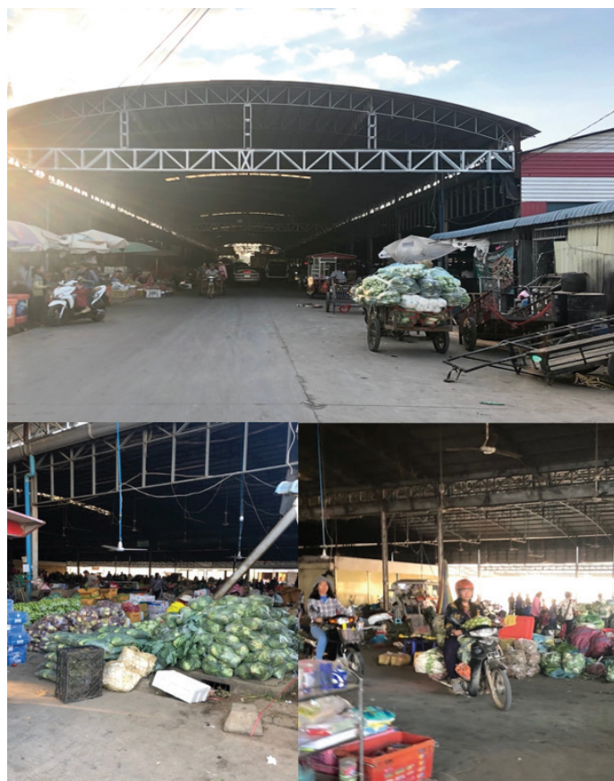
Figure 1. Vegetable distribution center at Battambang Province in Cambodia.

stomached for 2 min. Samples were serially diluted in 0.1% peptone water (BD) and plated to determine viable cell counts as described below.