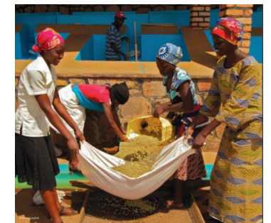
State of the Sector 2018