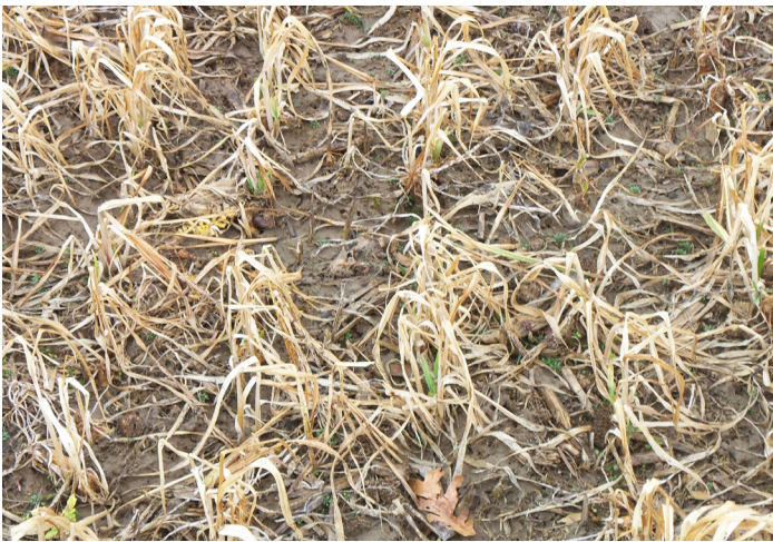
Figure 2. Residue of oats/radish mix in early March (Eileen Kladviko)