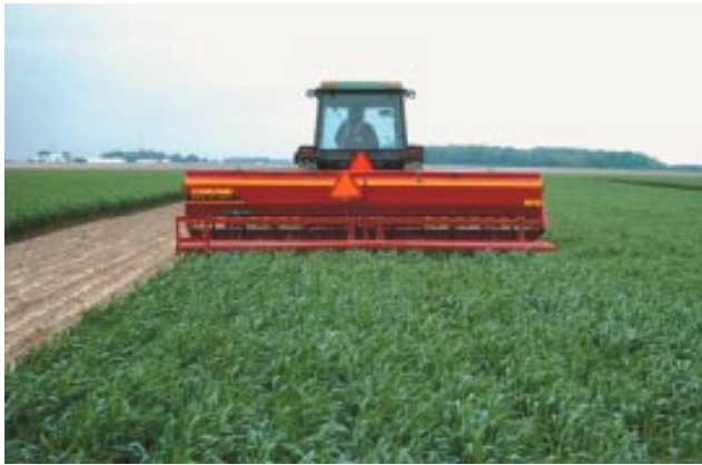
Planting Soybeans into Wheat Seeded in 15 Inch Rows

The recommended seeding rate for relay intercropped soybeans is 200,000 seeds per acre. Although this rate is higher than farmers normally plant in 15-inch rows, intercropped soybeans will be under more stress than their mono-cropped counterparts, and lower plant survival should be expected. The 200,000 seeding rate is still lower than that normally recommended for double-crop planting. The soybean variety selected should have good wide-spectrum resistance to soil-borne diseases such as phytophthora, as the additional stress to soybean seedlings in the relay system tend to increase plant susceptibility to pests.