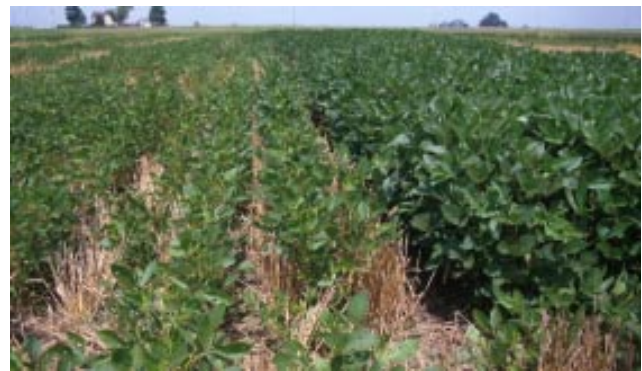
Successful Establishment of Relay Soybean versus Mono-crop Soybean Seeded the Same Day

Glyphosate-resistant soybeans are recommended for this system because of this herbicide’s excellent crop safety and its ability to control volunteer wheat and other late-