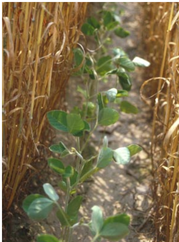
Soybeans Intercropped with Wheat

Planting time of relay intercropped soybean is usually based on the wheat’s physiological stage rather than calendar date. Most studies have shown that soybeans should be seeded before head emergence of the wheat.