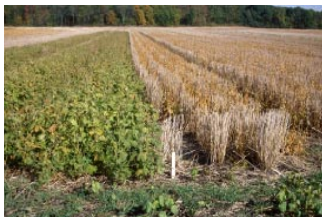
Maturity Differences Between Double-crop (left) and Relay Soybean Between Rows of Winter Wheat (right)

sive traffic damage in wheat harvest (resulting from combine tire widths totaling almost 5 feet in the narrow 15-foot plots) and the inclusion of data from 1999 (with well below-normal rainfall in July and August). In growing seasons with sufficient moisture, a reasonable expectation is that relay soybean yields between 50 and 60 percent of full-season soybean.